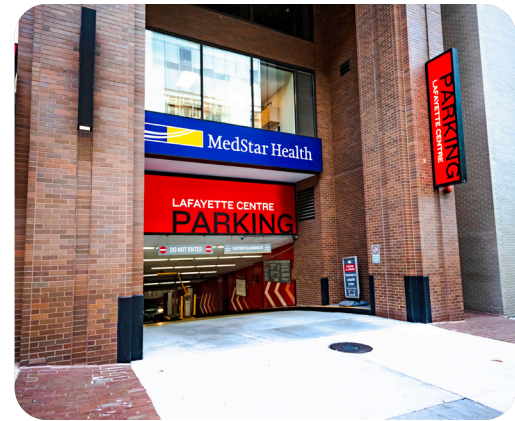
MedStar Health at Lafayette Centre map