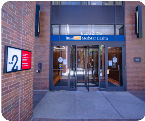
Lafayette Centre Building 2 lobby entrance from the courtyard

Our MedStar Radiology Network offers services on the 8th floor of Building 2. These services include 3-D mammography, CT, cardiac calcium scoring, DEXA, ultrasound, and X-ray on Saturdays and Sundays. During these hours, you may notice fewer associates and security staff at Lafayette Centre.