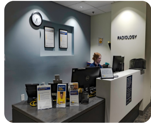
Radiology check-in desk on the left side of the 8th floor of Building 2