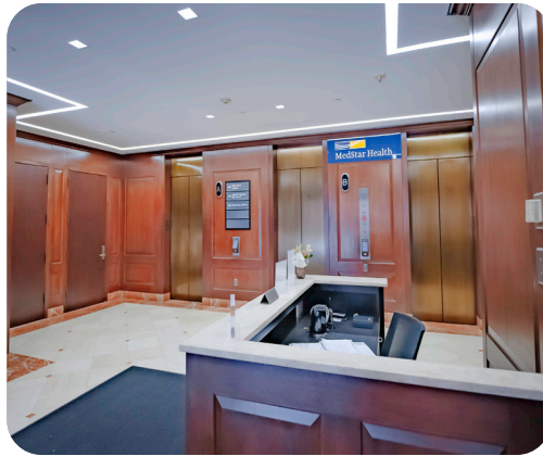
Lafayette Centre Building 2 lobby interior and destination elevators