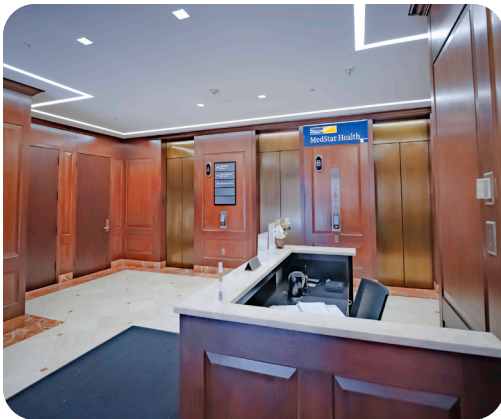
Elevators A, B, and C in the lobby

To access our services in Building 2 of Lafayette Centre, you will use the destination elevators. It is important to know that these elevators work differently than a standard elevator.