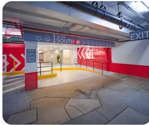
Entrance to Level A from the 20th Street garage