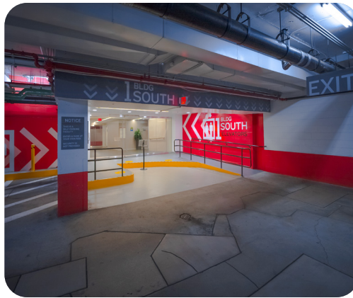
Entrance to Level A from the 20th Street garage