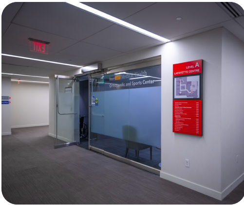
Entrance to the MedStar Health Orthopaedic and Sports Medicine Center

MedStar Health Orthopaedic and Sports Medicine is an outpatient care facility with physician offices, separate from our Physical Therapy department. The entrance to the Orthopaedic and Sports Medicine Center is located on Level A of Building 1 South.